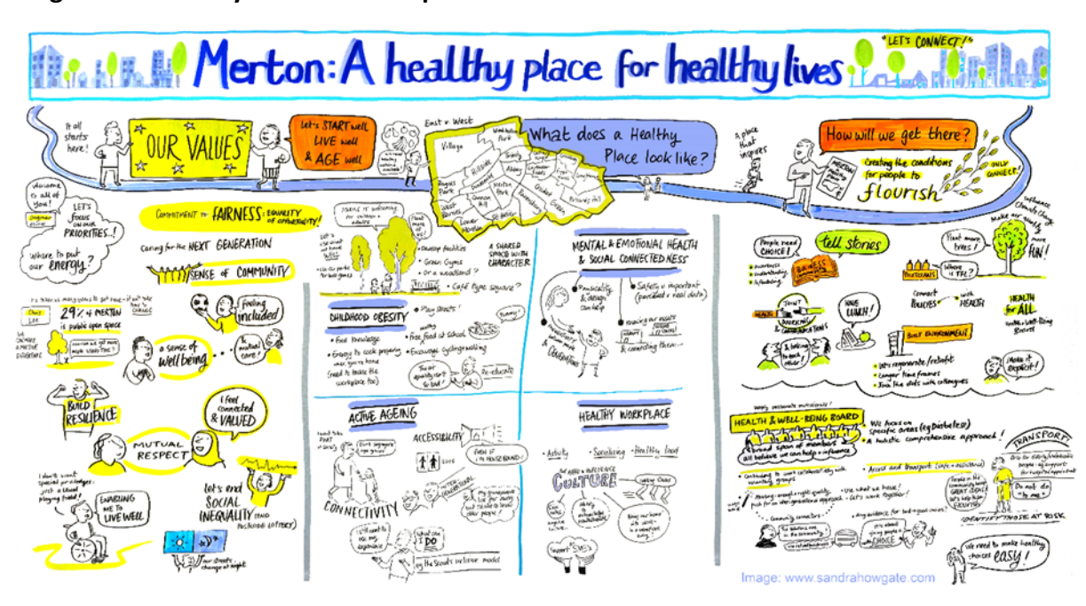
Diagram 4 - Healthy Place workshop illustration

The diagram below is a summary drawing of the findings from our Healthy Place workshop.